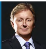
Henrik Fisker CEO, Fisker Automotive